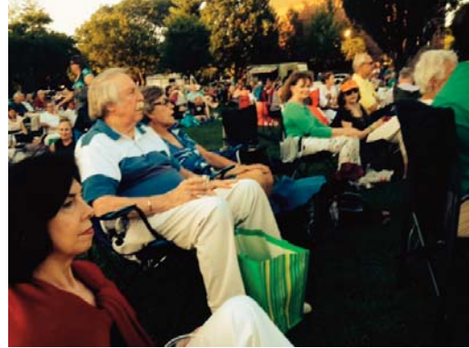
Members at Roger Sherman Park listening to Beach Boys music.