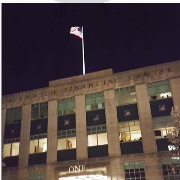
Old Glory flying over the Greenwich Financial Center

There is currently no book group meeting scheduled for May. If a meeting is announced, members will be notified at a later date.