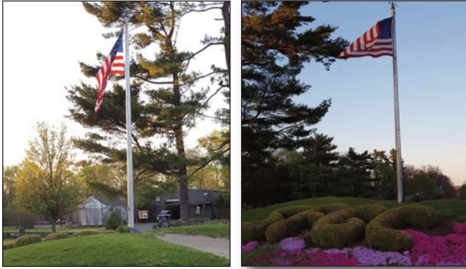
Sterling Farms Golf Course, Stamford, CT