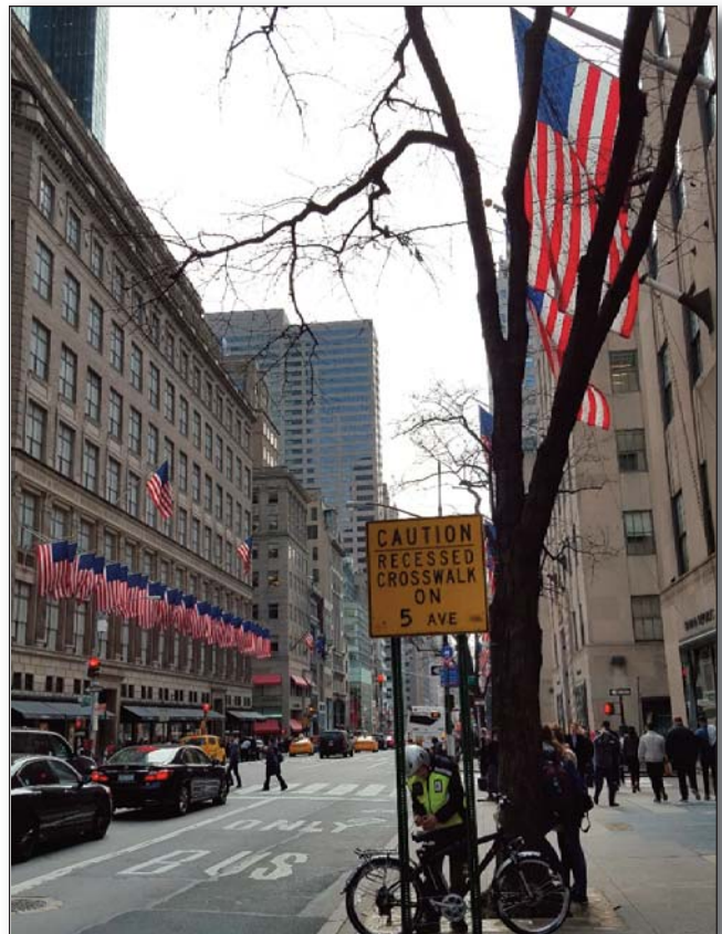
Displaying the colors on Fifth Avenue (Saks), NYC.