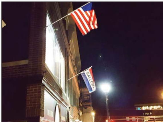
Left: Greenwich Avenue at night.