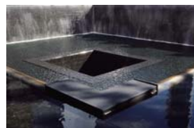
Reflecting Absence Pool