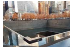
Reflecting Absence pool