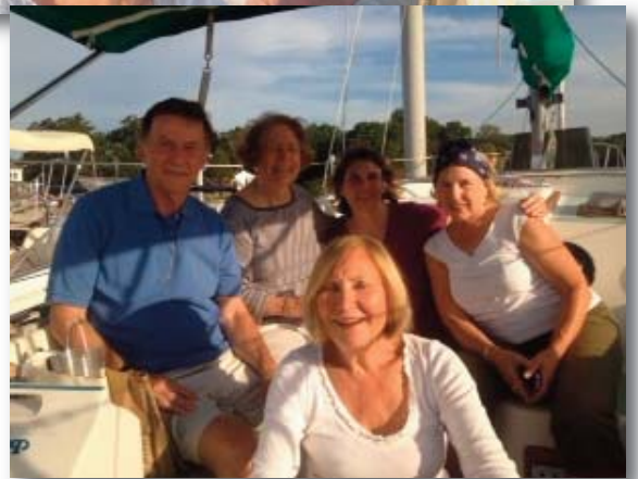
No "mutiny" anticipated by this crew!