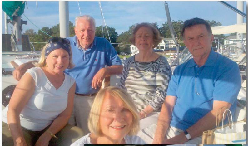
Aboard the "Bounty" – CCG August Board meeting