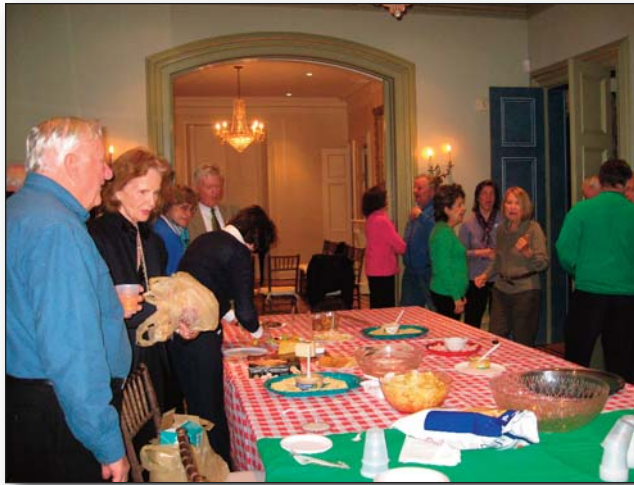
Good times and great conversations on First Wednesday at Tomes-Higgins House, April 4, 2012