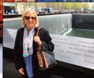
World Trade Center site (see photo descriptions pg. 2)