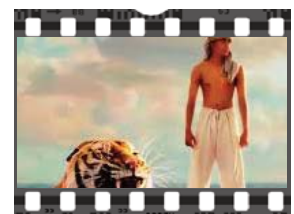
Life of Pi

TIME: 8:00 p.m. to 10 p.m. DATE: February 21 PLACE: Greenwich Main Library, Cole Auditorium, 101 West Putnam Ave., Greenwich