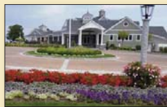
Golf club dinner dance