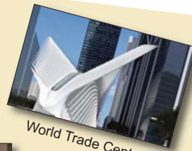
World Trade Center