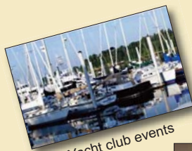
Yacht club events