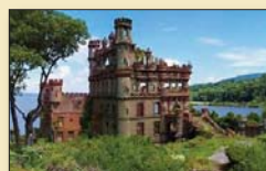
Castle on the Hudson

Take a look at the monthly newsletters on our website to see the broad variety of activities and interests we offer.